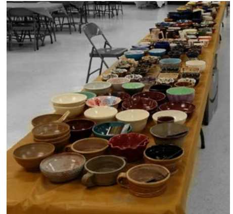
2014 Potters' Bowl

Won't you join us and become part of our Potters' Bowl Event Team? There are many different ways to assist with this grand event. The memorable Potters' Bowl is set to take place on Friday, March 13, 2015. We are looking for interested people to join our planning committee. Call 304-876-3325 to help us make this the best Potters' Bowl yet.